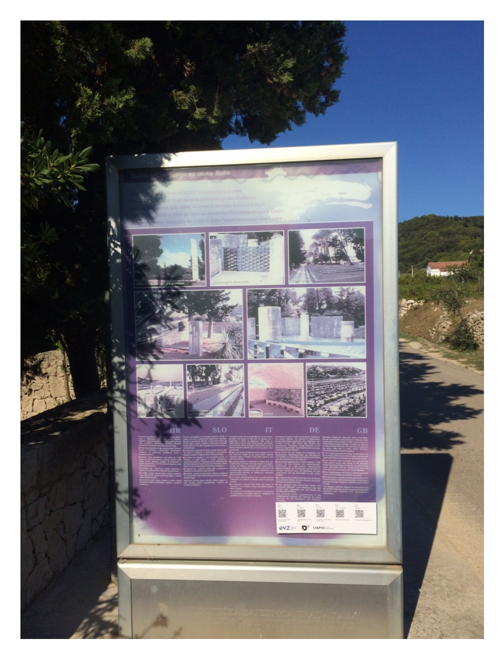
Information board with QR codes in front of the Memorial Cemetery Kampor